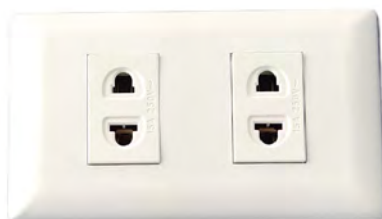
Two pins plug

The power supply used in Thailand is 220-240 AC, 50 Hertz. Electric plugs are of two types, with two pins and with three pins, as pictured below.