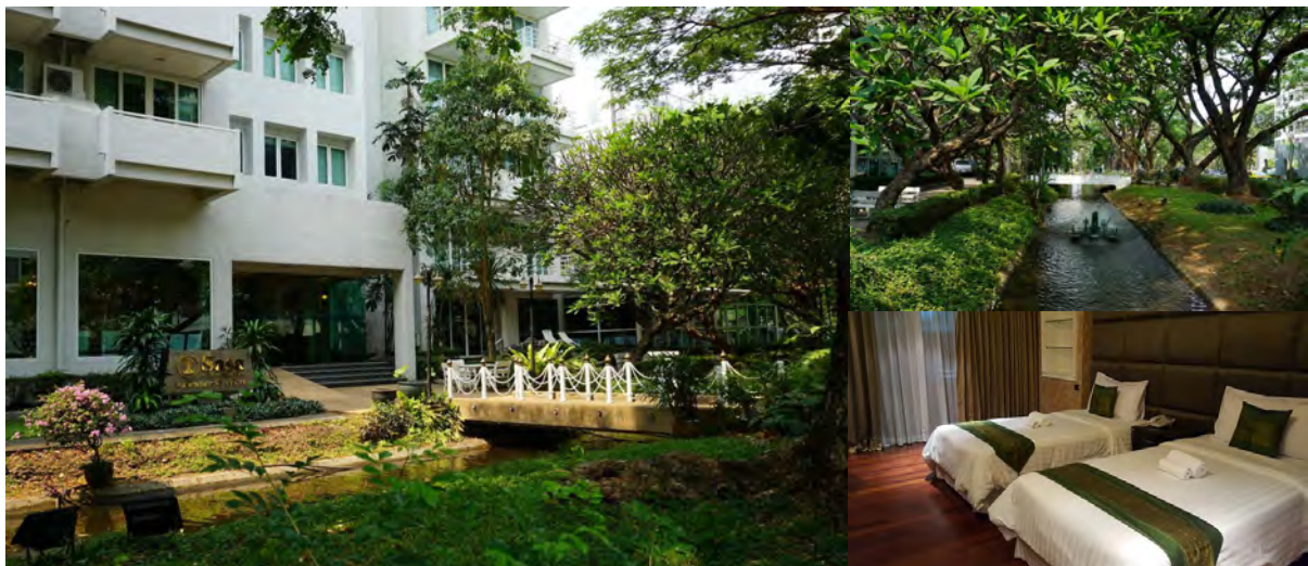
SASA INTERNATIONAL HOUSE.

A convenience Store, Bank, Currency Exchange, Pharmacy and other facilities are located at MBK center and Siam, 5 minutes-walk from Sasa International House.