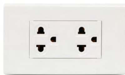
Three pins plug